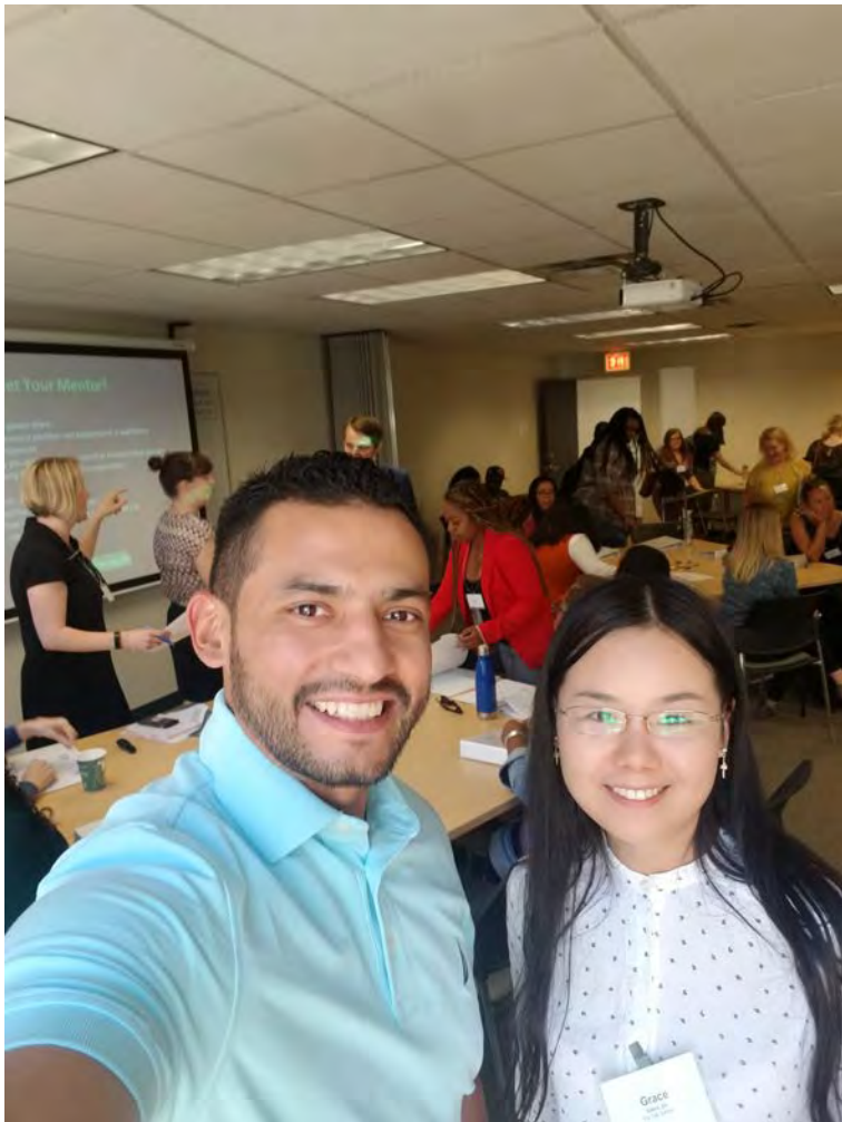
WIOA Title II Transition Specialist