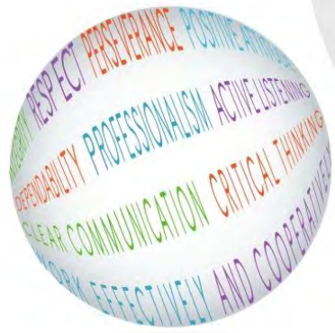
Illinois Essential Employability Skills Framework and Self-Assessment