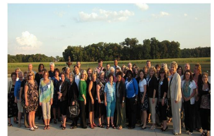
2012-2013 Transitions Academy Participants

College of Lake County Lincoln Land College Lakeland College McHenry College Elgin Community College Lewis & Clark Community College Danville Area Community College Daley College